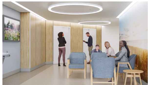
Figure 2: Rendering of 2nd Floor Lobby renovation with project