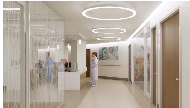
Figure 1: Rendering of the new unit and Nurse Station

Conversion of an existing hospital floor into a modern 18-bed short-term skilled nursing facility, enhancing the organization’s ability to provide transitional and post-acute care services to the community.